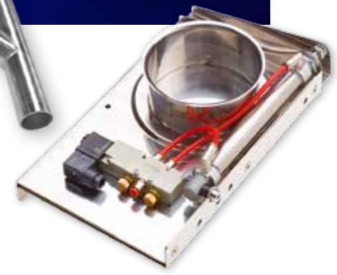
Dampers and Accessories