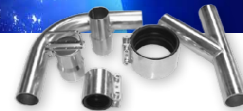
Duct systems High pressure