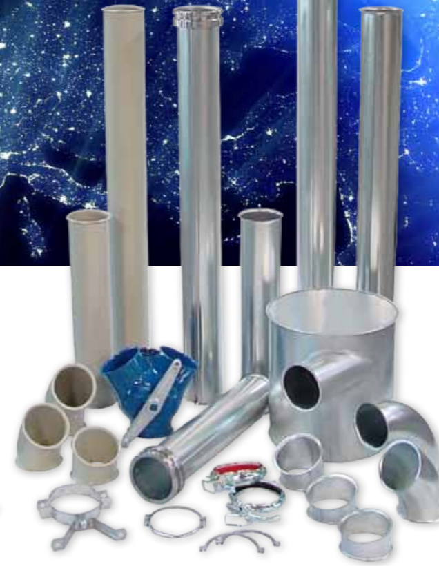
Duct systems Medium pressure