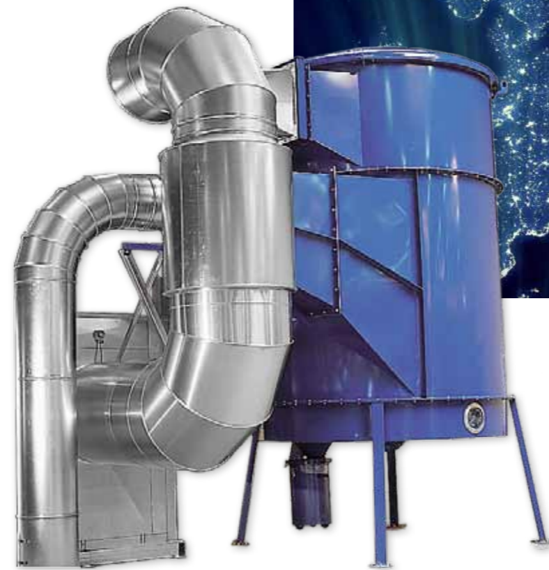
Filter and Fans